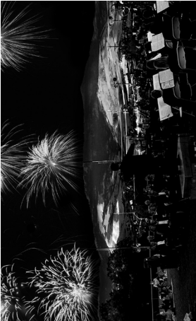
Two amazing band concerts directed by some of the world's best!

ABC AMERICAN BAND COLLEGE WIBC, Inc. 407 Terrace Street Ashland, OR 97520